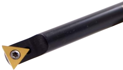
Inserts page 102

Use TPGB Inserts • Positive Rake • 11° Relief