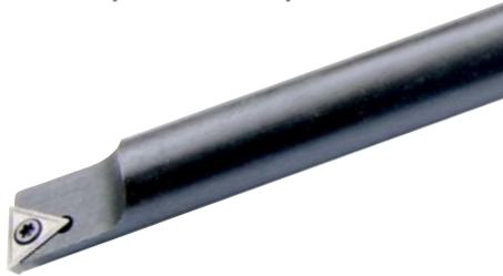
Inserts page 102